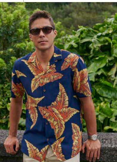
Kahala is open daily 10 am - 8 pm