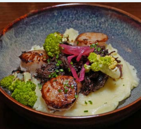
Patina is open Monday through Saturday from 4 to 9 pm. (808) 769-8700 | Reservations can be made at patinahawaii.com

Patina, an inviting new American gastropub at Queens' Marketplace, opened earlier this year with an impressive menu rooted in regional ingredients inspired by global flavors.