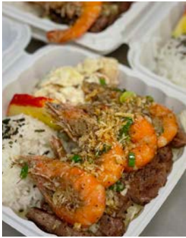
Waikoloa Shrimp Company