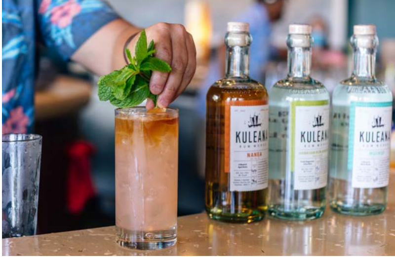
Kuleana Rum Shack

Please check with individual restaurants on hours of operation.