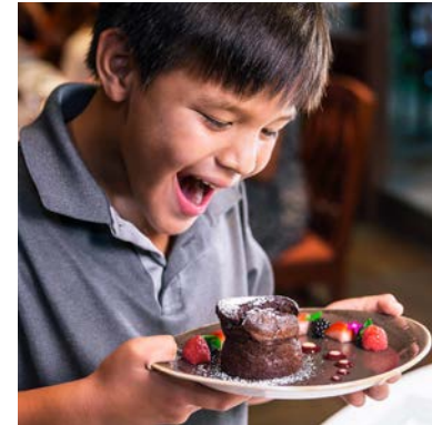
CLOCKWISE FROM ABOVE: Roy's Waikoloa Bar & Grill; Kamuela Provision Company; Gypsea Gelato