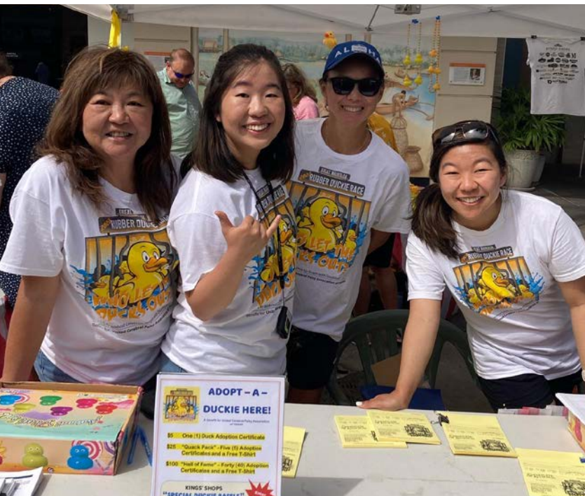
Above: Volunteers help make the Rubber Duckie Race a success each year.