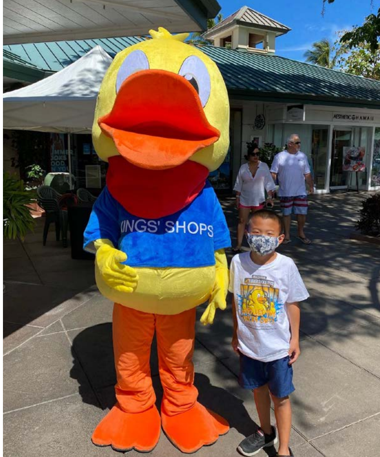
Above, right: Families are drawn to the event, with a variety of games and activities for children.