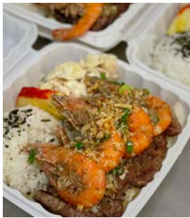
Waikoloa Shrimp Company