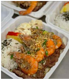
Waikoloa Shrimp Company