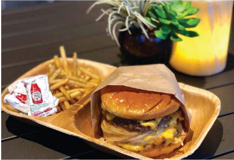
Bistro at the Cinemas

Please check with individual restaurants on hours of operation.