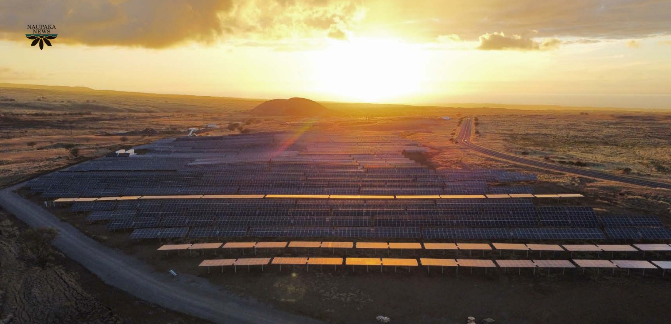
The 300-acre project has been underway in Waikoloa Village for four-and-a-half years.

to the island, with a total economic output of $47 million toward Hawai'i's economy.