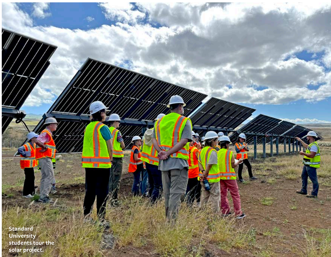
Standard University students tour the solar project.

Scan code to sign up to receive Waikoloa Beach Resort updates.