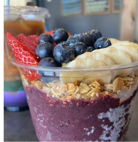
Hawaii Kind Grinds

Starbucks Coffee Company (808) 886-1888 Starbucks.com