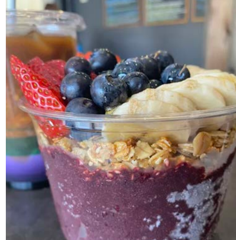
Hawaii Kind Grinds

Starbucks Coffee Company (808) 886-1888 Starbucks.com