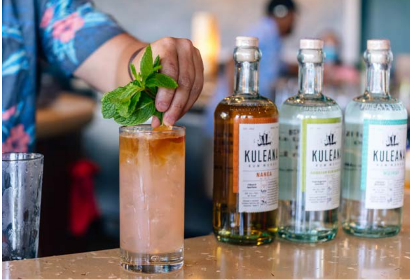
Kuleana Rum Shack

Please check with individual restaurants on hours of operation.