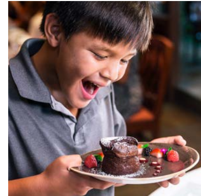
CLOCKWISE FROM ABOVE: Roy's Waikoloa Bar & Grill; Kamuela Provision Company; Gypsea Gelato